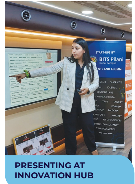
PRESENTING AT INNOVATION HUB