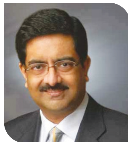
Dr. Kumar Mangalam Birla Chancellor, BITS Pilani