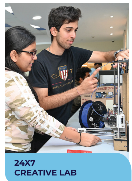
24X7 CREATIVE LAB